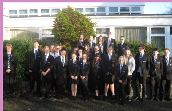
TCC's Student Council