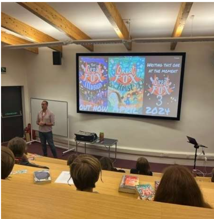
Kernow Youth Book Awards 2023 – attended by TCC students

Make sure you use the code TPBD2 to get the discount!